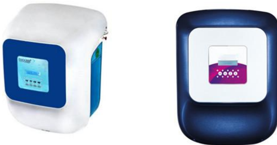
Graphic LCD for water purifier